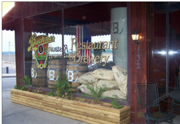
Existing Retail in The Old Town Cape District

Strategy: Produce articles and news releases about the conversion of Old Town Cape buildings to residential units. Also, prepare and publish articles about the renovations of some of the historic, single-family homes in Old Town Cape. Photos of these conversions should be included to visually support the articles. Pitch these stories to local papers, real estate magazines, radio talk shows, and local news programs. To reach people who may be interested in restoring historic buildings, distribute these stories to national magazines that appeal to that market.