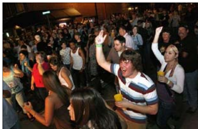
River City Music Festival

Strategy: The Convention and Visitors Bureau has already produced an excellent marketing DVD—“Come Explore Cape Girardeau, Missouri.” The DVD is a prime tool for soliciting conventions and tour groups. It should also be made available via the Old Town Cape, Inc. website as a resource for tourists thinking about visiting Cape Girardeau.