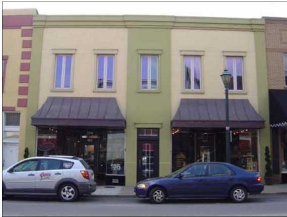
Retail Stores in Riverfront Area.

Market The Old Town Cape District as a boutique and unique shopping experience. It is important to market the area by showing customers the special and unique experiences that are only available in The Old Town Cape District.