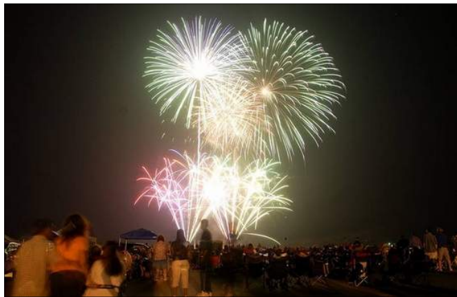
Fireworks at Libertyfest

This marketing plan identifies seven primary objectives. Taken together, these seven objectives promote one key message— The Old Town Cape District is a unique and exciting place to shop, visit, work and live.