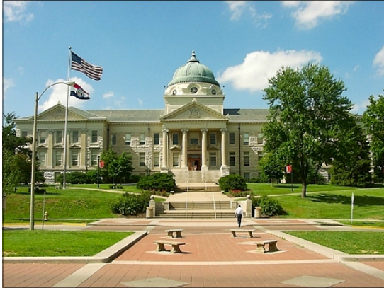
Southeast Missouri State University Campus

Strategy: Develop a stronger presence on the Southeast Missouri State University campus through special discounts for students at Old Town Cape District shops. Also place ads in the school newspaper and work with the campus editor to investigate the possibility of designating a beat reporter for The Old Town Cape District.