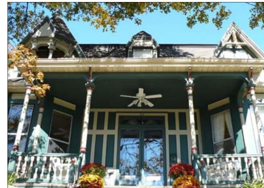
Bellevue Bed & Breakfast

Strategy: Reinforcing the idea that The Old Town Cape District is an exciting place to visit and shop is important to help reinforce its identity. Marketing the area as a place that has something for all target markets including workers, college students and residents, is important in enticing these groups to visit The Old Town Cape District.