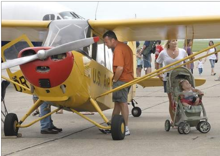
Heroes and Legends Air Festival

The tour itinerary could then be printed out. This would be a good way to promote to both locals and tourists, the variety of activities that are available in Cape Girardeau. Students and locals might also want to use this resource when they have visitors.