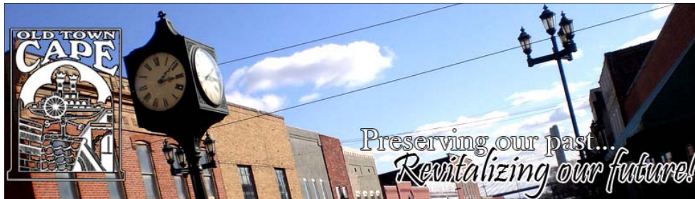
The Old Town Cape website masthead