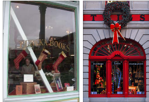
Examples of Storefronts Decorated for Christmas

based strictly on appearance, or they could also be theme based, which would be most appropriate around certain holidays and seasons.