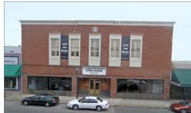
"Live the River" at Mississippi Riverfront Downtown Lofts

Strategy: Increase the number of available housing units in the Downtown area. Many baby boomers and young professionals are looking for alternative housing that provides an urban feel. These housing options are located within the Downtown and are within walking distance of shopping, dining and entertainment opportunities. Highlight the ways in which Old Town Cape living meets the life style needs of retirees and young professionals. Include testimonials from individuals that live in the area and consider the idea of housing tours to increase awareness of housing in Old Town Cape.