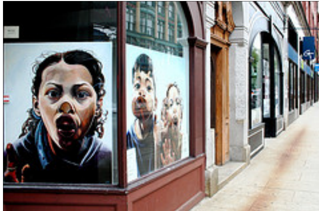
Example of Artists' Work Displayed in Empty Storefronts

Strategy: Fill vacant store fronts with local art and signage promoting Downtown or other stores window displays. If storefronts remain vacant, make sure they are maintained.