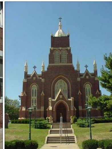
St. Vincent De Paul Church