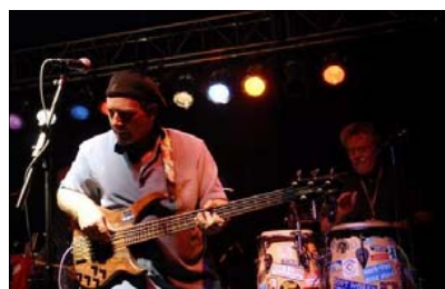
SEMO District Fair