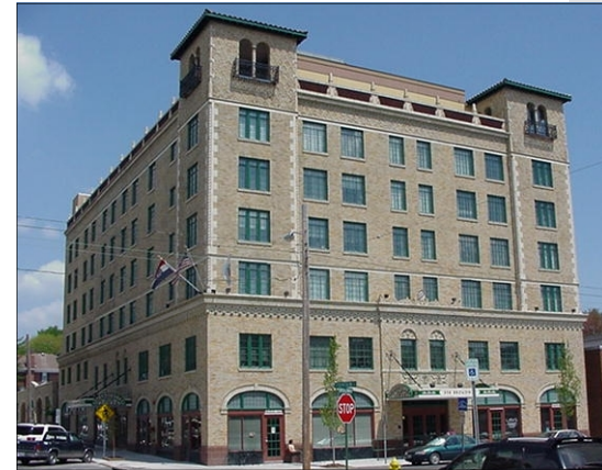
Marquette Hotel Building

The Old Town Cape District is also in need of surface parking lot improvements. Signage is needed to identify which lots are for public use, and the general appearance of public lots needs improvement as well.