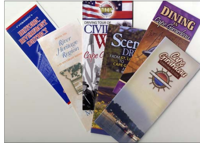
Existing Marketing Brochures for Cape Girardeau

Strategy: Provide downloadable versions of all of Cape Girardeau’s brochures in PDF format.