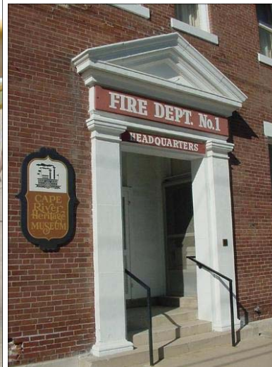
Cape River Heritage Museum