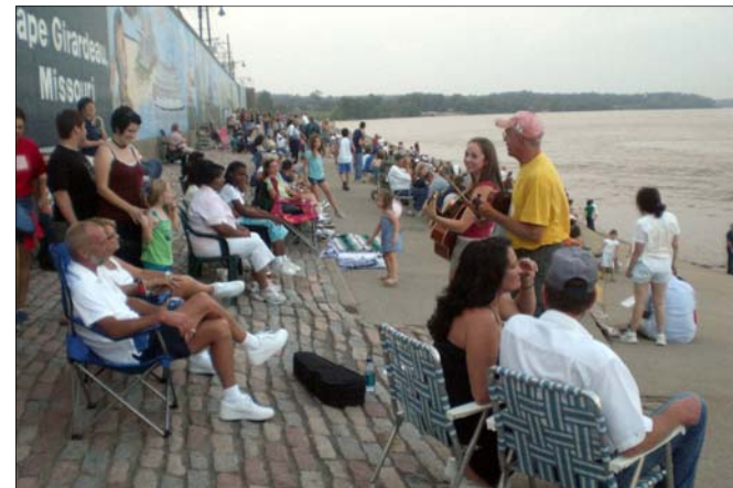
Existing Mississippi Riverfront in Cape Girardeau

The issues about which to inform the public; activities, new businesses and current business expansions, can be addressed with increased advertising. Rebranding The Old Town Cape District to be an all encompassing area for the Downtown as well as the three neighborhoods (Broadway, Riverfront, & Good Hope/Harrig) will call for a cohesive marketing effort to inform the public that all of these neighborhoods are within the Downtown area.