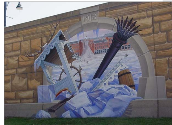
Mississippi River Tales Mural